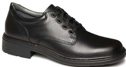
Black leather school shoes to be worn with the Summer or Winter Uniform

In winter, additional layers for warmth may be necessary for some students. If non-CBC uniform items are worn, they must not be visible or replace an item that already exists as part of this policy.