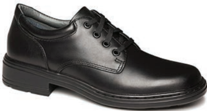
Black leather school shoes to be worn with the Summer or Winter Uniform